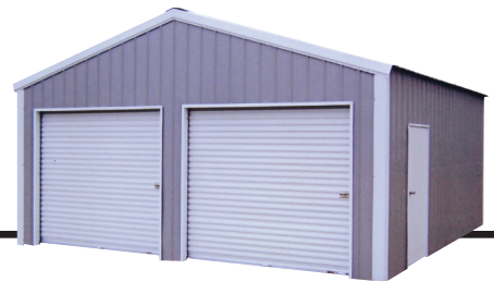
A-Frame Vertical Style