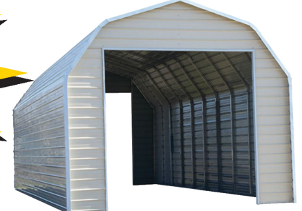
6 Sided Hexagon Style

WE WILL MATCH ANY COMPETITOR'S PRICE ON IDENTICAL BUILDINGS!