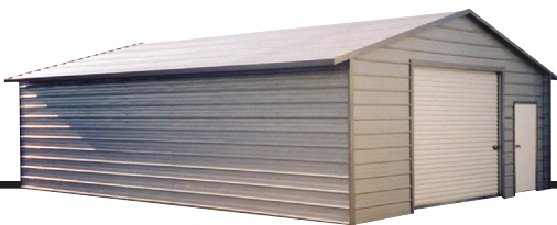
A-Frame Horizontal Style